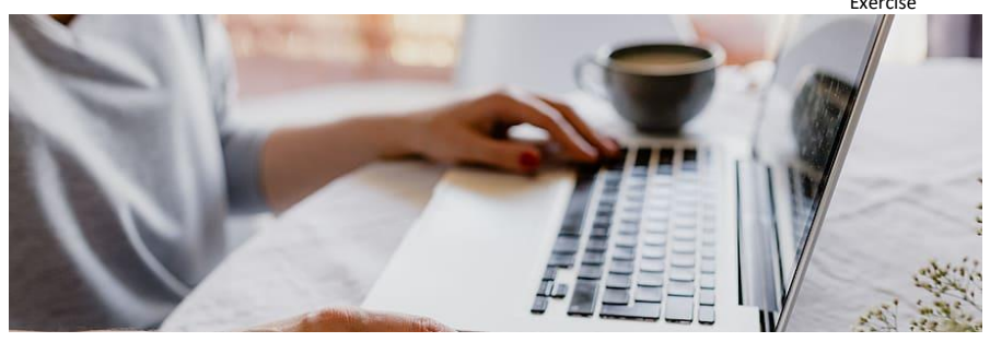
CLASS 2 - LAYOUT

The following are some useful equipment and associating vocabulary. If you are asked what you need for your presentation you will have an answer!