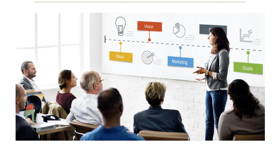
T_{ips} Presentation Skills