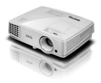
Liquid Crystal Display (LCD) projector