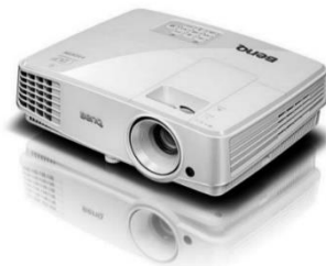
Liquid Crystal Display (LCD) projector